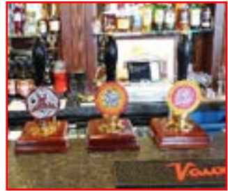
The bar of the Bridge Hotel Vaults in December - with Wear Beer Red, Vaux Pale Ale and Vaux Best Bitter

Their Sunderland taproom is now open only on Sunderland AFC match days with no cask ale Their new venture, The Bridge