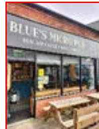
Blues Micro Pub