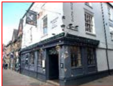
Above - the popular King's Head in Carlisle was a State Management pub from October 1916 to May 1973. Look for the small plaque inside the door.

This piece of Scottish legislation will allow all pubs to stock a beer from any brewery outside of the tie. This is of interest in Cumberland for a number of reasons. The most obvious one is Cumberland