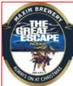
Pump Clip from Maxim

As well as the core beers from Maxim, their four Xmas beers will be available in December.