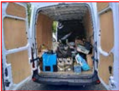
The art of getting it all in the van