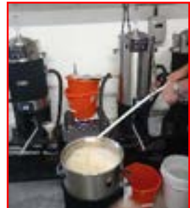
Transfer to fermenter

Once the wort is in the copper, the Magnum hops are added and boiled for an hour. At the end of the boil, the wort is allowed to cool before Saaz hops are added with Carrageen, a natural seaweed product