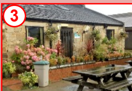
STEPS 47 Spout Lane, Washington, NE38 7HP 0191 4150733 Bus 84