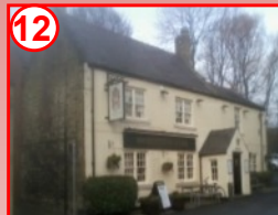
MILL HOUSE B1288, Blackfell, DH3 1RE 0191 4151313 Bus X25 (300m)