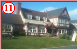
HAVELOCK Bonemill Lane, Washington, NE38 8AJ 0191 4159739 Buses 2,2A,4,8