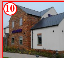
COURTYARD Biddick Lane, Washington, NE38 8AB 0191 4170445 Buses 2A,4,8