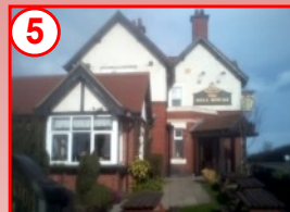
TOBY CARVERY Emerson Road, Washington, NE38 1LE 0191 4194449 Buses 50,81,82