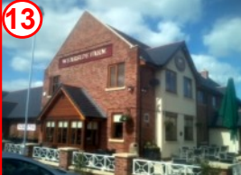
OX & PLOUGH Oxclose Village Centre, Washington, NE38 0LZ 07890901012 Buses 85,86