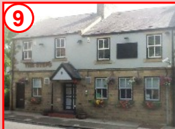
CHAMPS Emerson Road, Washington, NE37 1LE 0191 4153341 Buses 50, 81, 82