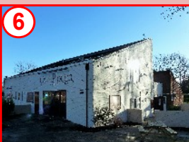
WASHINGTON ARMS The Green, Washington, NE38 7HP 0191 4187843 Bus 84