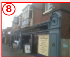
BIDDICK INN Bonemill Lane, Washington, NE38 8AJ 0191 4195101 Buses 2, 2A, 4