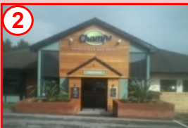
SIR WILLIAM DE WESSYNGTON Concord, Washington, NE37 2SY 0191 4180100 Bus Stn Opp.