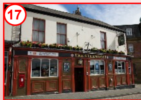
STEAMBOAT 27 Mill Dam, South Shields NE33 1EQ 0191 4540134