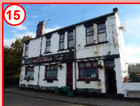
ROSE & CROWN E Holborn, South Shields NE33 1RJ 4552379 Bus & Metro 10- 15 minute walk

There are other real ale pubs in South Shields not covered by the map. These are :- The County, Vigilant, Grey Hen, Harley's Bar, Marsden Inn, New Ship, Old Ship.