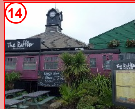
RATTLER Sea Road, South Shields NE33 3LD 455 6789 Bus E1, 516