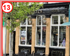
THE PIER 140 Ocean Road South Shields NE33 2JJ 0191 4540013 Bus E1, TB503