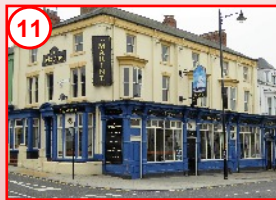
MARINE, 230 Ocean Road, South Shields NE33 2JQ 0191 4550280 Bus E1, 516