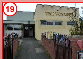
VOYAGER 145 Anderson Street South Shields NE33 1RJ 4272941