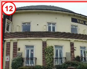
NEW CROWN Mowbray Road, South Shields NE33 3NG 4557323 Bus E1, 516