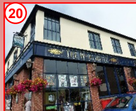
WOULDHAVE 16 Mile End Road, South Shields. NE33 1TA 4276014