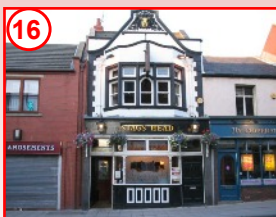
STAGS HEAD 45 Fowler Street, South Shields NE33 1NS 4272911

There are other real ale pubs in South Shields not covered by the map. These are :- The County, Vigilant, Grey Hen, Harley's Bar, Marsden Inn, New Ship, Old Ship.